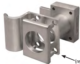
ETS1-PL Through-bolt pull